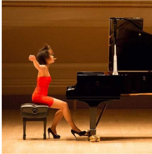
Yuja Wang